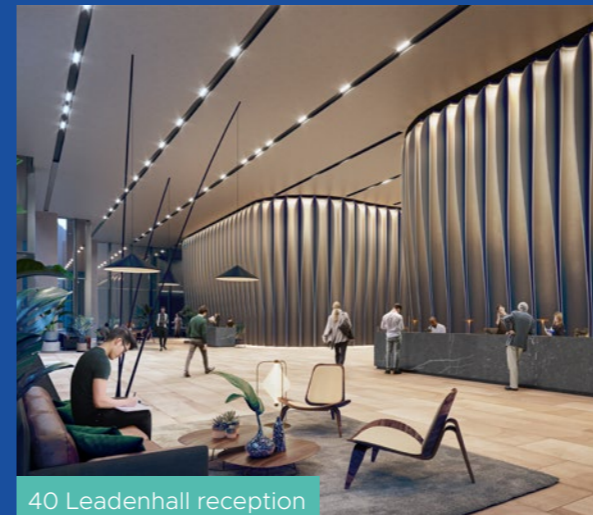
40 Leadenhall reception

Screening room which will host monthly movie nights