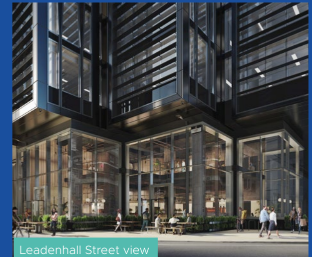
Leadenhall Street view